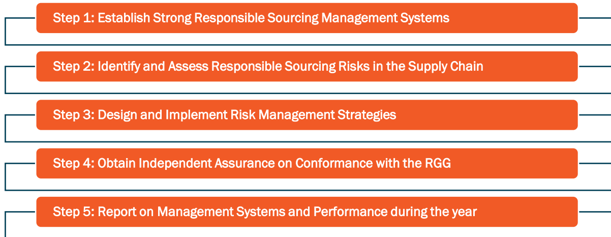
Figure 3: OECD Five-Step due diligence Framework

The RGG is based on the OECD's Five-Step due diligence framework for sourcing minerals from Conflict-Affected and High-Risk Areas, and the OECD Due Diligence Guidance Gold Supplement.