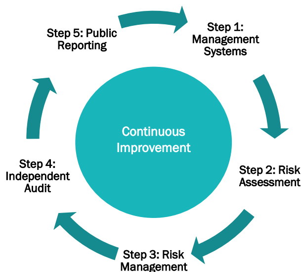
Figure 4: LBMA RGG Five-Step Due Diligence Framework